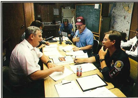
OHM team coordinates a Delaware River oil spill response with U.S. Coast Guard officials