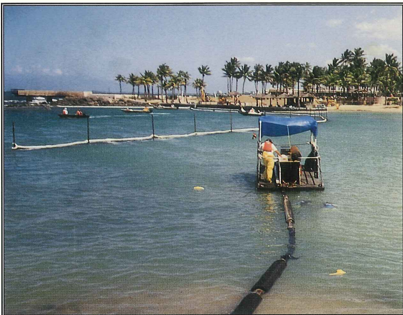
◀ Dredging of submerged oil in San Juan, Puerto Rico