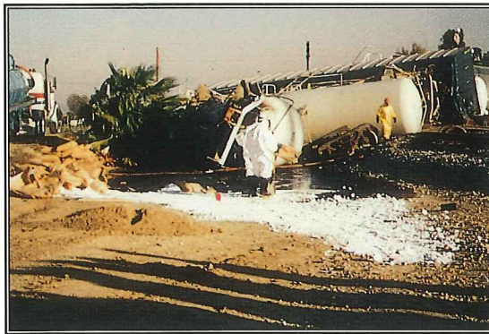
Derailment response resulting from Los Angeles earthquake