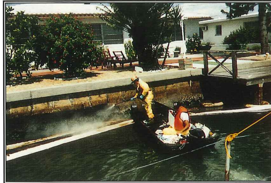
High-pressure washing to remove oil following Tampa Bay barge collision

For 24-Hour Emergency Response, Call 800-537-9540