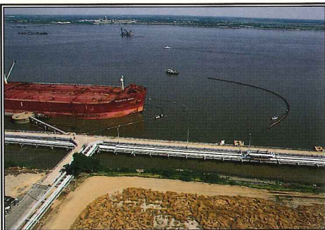
Boom deployment following Delaware River spill