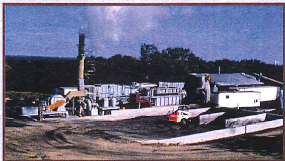
On-site Thermal Remediation of PCB-Contaminated Soils at Twin Cities Army Ammunition Plant, Minnesota