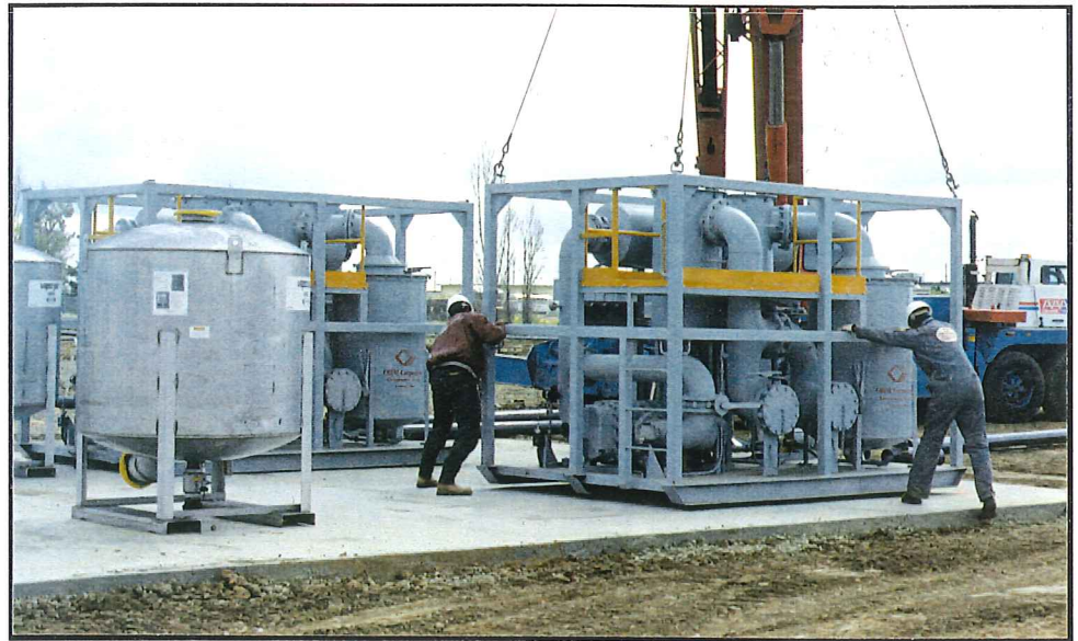
Cost-effective military remediation was completed through full-scale application of OHM's proprietary fluid injection with vacuum extraction process at the Sacramento Army Depot Burn Pits Operable Unit.

OHM Remediation Services Corp. has successfully executed more than 1,500 delivery orders under federal term contracts, and more than 150 site-specific federal remediation projects. Our 26 years of hands-on, field-proven experience enables us to employ a practical perspective to ensure the most cost-effective solution . And, our broad-based technology options meet the DOD's technical and site requirements for remedial actions.