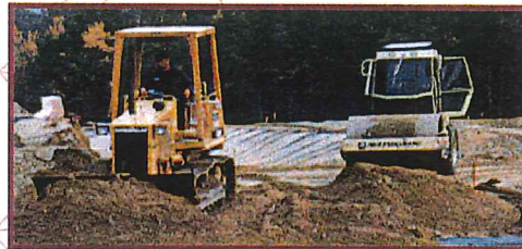
Site Preparation for Construction of Groundwater Treatment and Air Sparging/SVE Systems, Naval Air Station, Brunswick, Maine