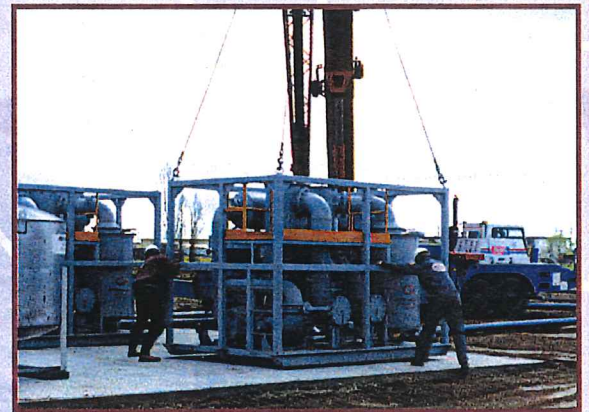
Fluid Injection/Vacuum Extraction at Burn Pits Operable Unit, Sacramento Army Depot, California

OHM's Remedial Programs: • USACE Pre-Placed