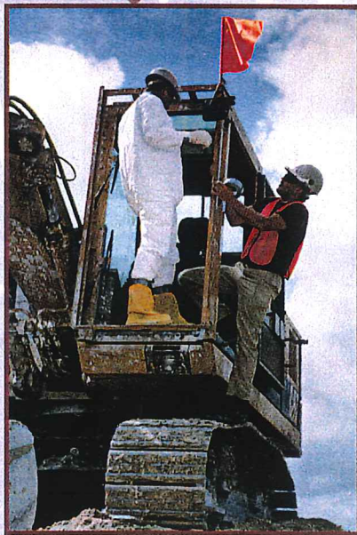
Emergency Response/Remediation for Base Realignment after Hurricane Andrew, Homestead Air Force Base, Florida

Wherever your environmental trouble spots are, call OHM... helping you lead the way in