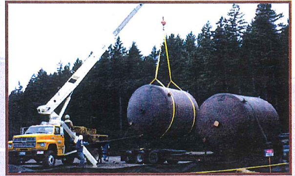
Extraction/Treatment/Reinjection of Ordnance-Contaminated Groundwater at Site F, Naval Submarine Base, Bangor, Washington

The tide has turned. A new wave of fiscal constraint means that every environmental restoration cleanup dollar must count toward the mission. OHM has been on the frontlines of successful on-site field remediation for 26 years. We have 17,000 large and small actual cleanups under our belt and over $90 million in pre-deployed specialized remediation equipment and facilities— located close to you. OHM's strategically placed remedial term contracts meet Installation Commanders' cleanup needs for Defense Environmental Restoration remediation. Our personnel and our SB/SDB partners are already in place near many major active installations and BRAC bases. When you need quality and safety, on time and within budget, count on OHM.