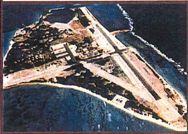
UST/AST/Pipeline Remediation, Naval Air Facility, Midway Island

From Midway Island to Homestead AFB to Fort Richardson Alaska, from Sacramento Army Depot to Twin Cities Army Ammunition Plant to NAS Brunswick Maine— At these and many other places in our beautiful nation, OHM and its team partners are proud to serve under our nation's military services— proving that successful military remediation can be cost-effective for the taxpayer.