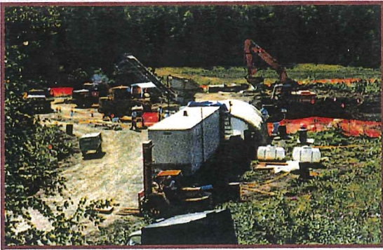
Selective Excavation/Separation/Screening of CWM Disposal Area, Fort Richardson, Alaska